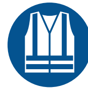
HIGH VISIBILITY CLOTHING