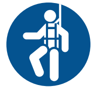
FALL ARREST HARNESS